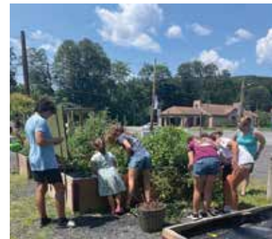
Girl Scouts busy tending last years garden.